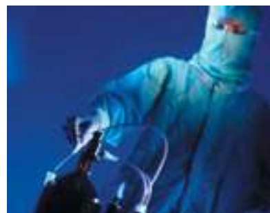
The research work in the pharmaceutical factory Lek.