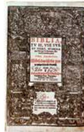
The Protestant writer and theologian Jurij Dalmatin (around 1547-1589) published the first Slovenian translation of the entire Bible in 1584.

Primož Trubar is one of the most important pillars of Slovenia's cultural and national identity, and thus a figure