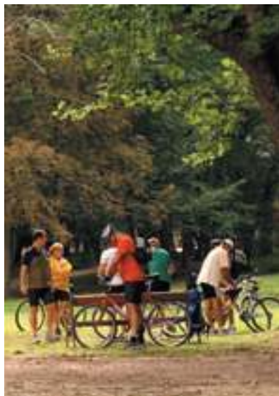
Riding bicycles is very popular in Slovenia.

One of the most popular sports in Slovenia is skiing. Sometimes Slovenian skiers win international medals. When thinking about the two best Slovenian athletes, one cannot avoid the impression that they tell us something about Slovenes – the female athlete of 2010 was Tina Maze, an alpine skier, while the title of male athlete of 2010 went to Dejan Zavec, current IBF (International Boxing Federation) World Champion. In a way, they symbolise Slovenia: a country, which is young, but not shy of success.