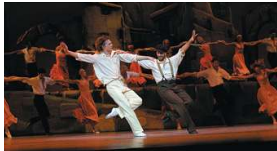
Scene from the ballet Zorba the Greek, produced by SNG Maribor.

Slovenian plays were performed alongside German plays throughout the 19th century, while the first Slovene language professional theatres appeared after the First World War. After the Second World War, there was at least one theatre in every major Slovenian town (including Trieste, which although now part of Italy, has an important Slovene population). Today, there are six national theatres outside Ljubljana, while the country's leading theatres remain the so-called Slovene National Theatre Drama (SNG Drama) companies with opera and ballet houses in Ljubljana and Maribor, respectively. There are a few dozen Slovenian theatre companies, both professional and amateur, including modern dance groups. In 2008, these groups offered their audiences 205 productions that premiered in the season. Some 4,160 performances were seen by 867,220 spectators.