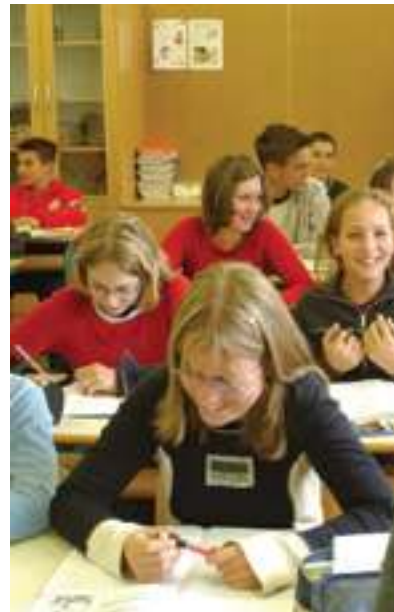
The compulsory basic education lasts for nine years.

www.mg.gov.si Ministry of the Economy www.umar.gov.si Institute of Macroeconomic Analysis and Development www.gzs.si Chamber of Commerce and Industry of Slovenia www.stat.si Statistical Office of the RS www.investslovenia.org Invest Slovenia www.sloveniapartner.com Gateway to Slovenian business www.gzs.si/sloexport Sloexport www.sycp.si Slovenia Your Cooperation Partner www.slovenia.info Slovenian Tourist Board