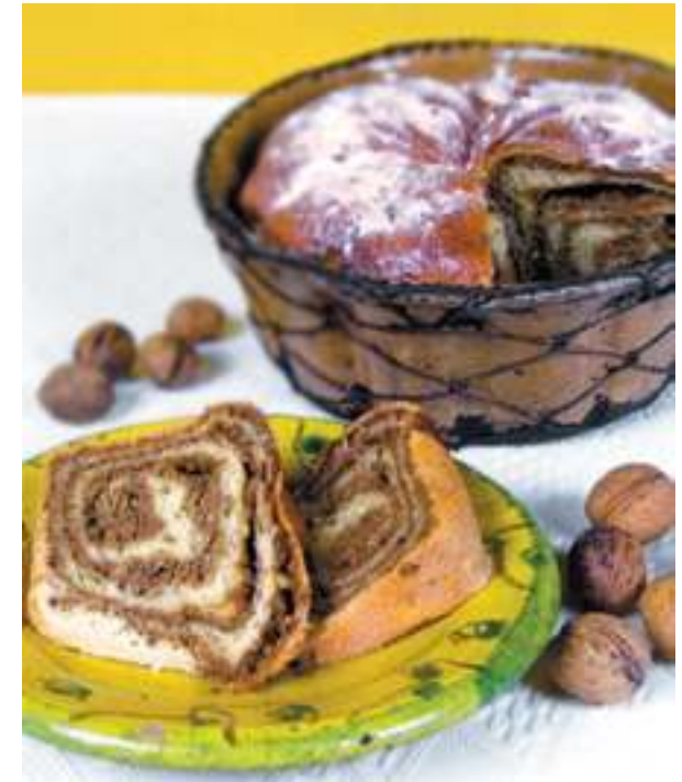
Potica , a yeast dough roll, filled with nuts.