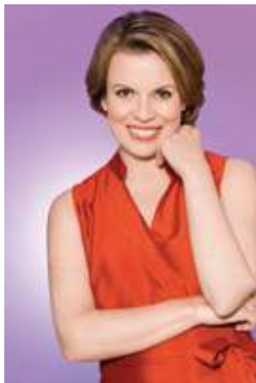
The mezzo-soprano Bernarda Fink.