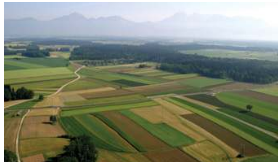
The countryside in the Gorenjska region, with Kamnik-Savinja Alps in the background.

The northwestern part of Slovenia is Alpine and is known as Gorenjska. For centuries, it has been the most developed Slovenian region, with the longest tradition in tourism. It boasts several towns with beautiful historic centres, such as Škofja Loka, Radovljica, Kranj, Kamnik and Tržič. Kropa and Kamna gorica are centres of iron forging, nail-making and blacksmithing, while the ironworks at Jesenice, the region's largest, date from more recent times. The town of Jesenice is also the cradle of Slovenian ice hockey. Gorenjska is synonymous with winter sports. Numerous ski resorts and the world-famous ski-jumping hills at Planica are all essential elements of the region's winter image. Bled, Bohinj and Kranjska Gora have for many years been among the most popular Slovenian tourist destinations. The town of Kranj, the industrial and business hub of Gorenjska, is the seat of the successful Sava Tyres Company, which combines the Slovenian rubber industry tradition which spans more than eighty years with the new opportunities provided by the business link with the Goodyear Corporation. The creative business image of Gorenjska is reflected in many other traditional and modern business activities, which include the Begunje-based sports equipment and ski manufacturer Elan, and the Seaway Company from the Bled area which builds top-class yachts and boats which have won many prestigious international awards.