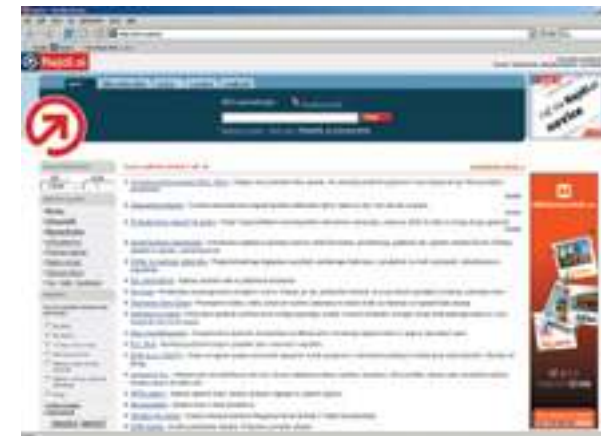
Najdi.si is a popular Slovenian search engine.

In addition to these public radio programmes, there are more than 75 regional and local commercial and noncommercial radio stations. According to the radio audience research Radiometrija/Media Pool, the most listened to public national programmes in 2009 are: Val 202 with a 13% and Programme ARS with an 11% audience share. At the top of popularity on the regional level were Radio City, Radio Hit and Radio Koper.