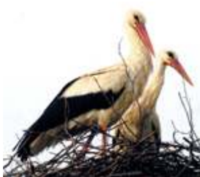
Storks nesting in Prekmurje.

Slovenj Gradec is the most important town in Koroška. It is a major business and cultural centre and is well known for a variety of fine arts events, as well as for organising biennial exhibitions of Slovenian traditional crafts and applied arts. The town is also proud of its Messenger of Peace status awarded by the United Nations Organisation. Slovenj Gradec is the seat of a successful business group, Prevent Global d.d., a leading European manufacturer of car seat covers, protective clothing, and accessories. The company has production facilities elsewhere in Slovenia and around the world. In the Mežica Valley lies the well-known Ravenska železarna ironworks. At Mežica, the disused lead mine has been preserved and converted into an exceptional museum, which is a cultural attraction popular with visitors.