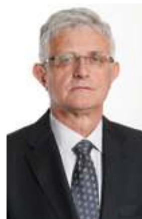
Dr Pavel Gantar, speaker of the Parliament

The National Assembly exercises legislative, voting and monitoring functions. As a legislative authority, it enacts