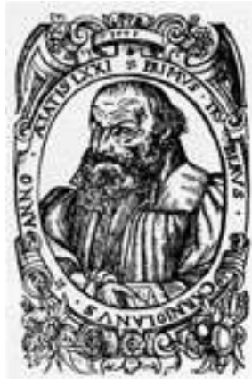
Primož Trubar, wood engraving by Jacob Lederlein, 1578.

In the middle of the 16th century, the Reformation, mainly Lutheranism, spread across Slovenian territory, helping to create the foundations of the Slovene literary language.