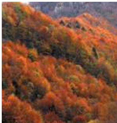
In the forests, covering almost 58% of the Slovenia territory, a wide variety of vegetation and wildlife has been preserved.