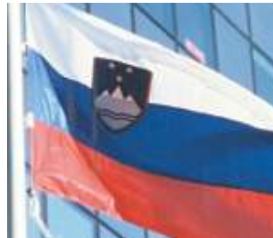
Slovenian national flag.