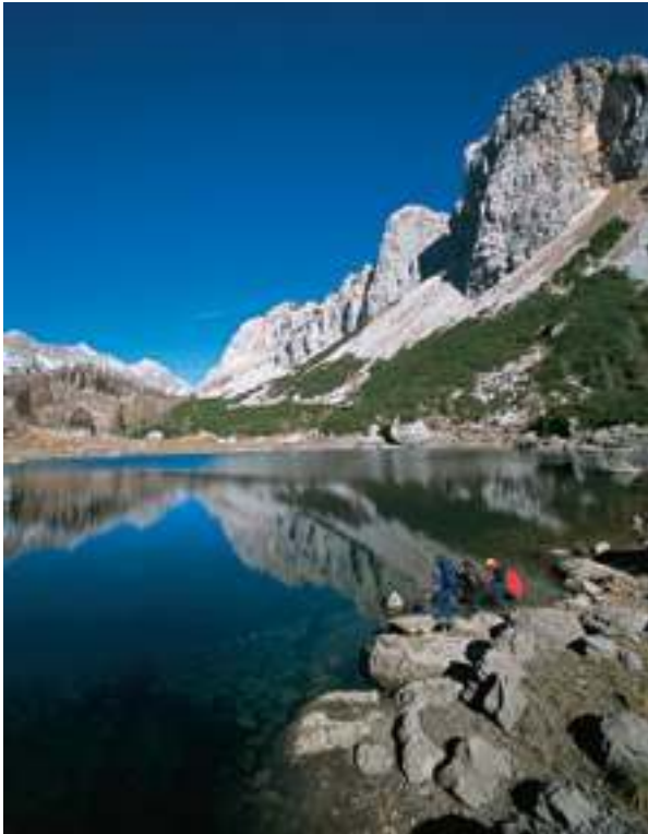
One of the seven Triglav lakes.

The largest protected area in the country is the Triglav National Park, which encompasses nearly 4% of the territory of Slovenia (83,807 ha). The park's diverse configuration consists of mountain ridges, glacial valleys and lakes, surface and subterranean karst phenomena typical of high-lying areas, the sources of the Sava and the Soča rivers with numerous waterfalls and deep river beds. The vegetation in the park is mainly Alpine with numerous endemic species. Among the characteristic animal species of the area is the endemic Soča trout.