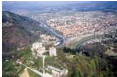
Celje with the ruins of the castle, once the seat of the Counts of Celje.

developing towns, which hosts, among other events, an annual International Trade Fair (MOS), the largest business and trade fair in the southeast Europe. Celje is also a good starting point for a visit to the Šaleška and Savinjska Valleys. In the lower Savinjska Valley, hop cultivation has been one of the main agricultural activities since the 19th century, while the upper part of the Valley is particularly interesting as a developing tourist destination: it is the starting point for mountain hiking excursions in the Savinjska Alps. The Šaleška Valley is known for the Gorenje Company, which is based in the town of Velenje. The Gorenje Company manufactures top-quality washing machines and other home appliances and is one of the most internationally recognised Slovenian brands.