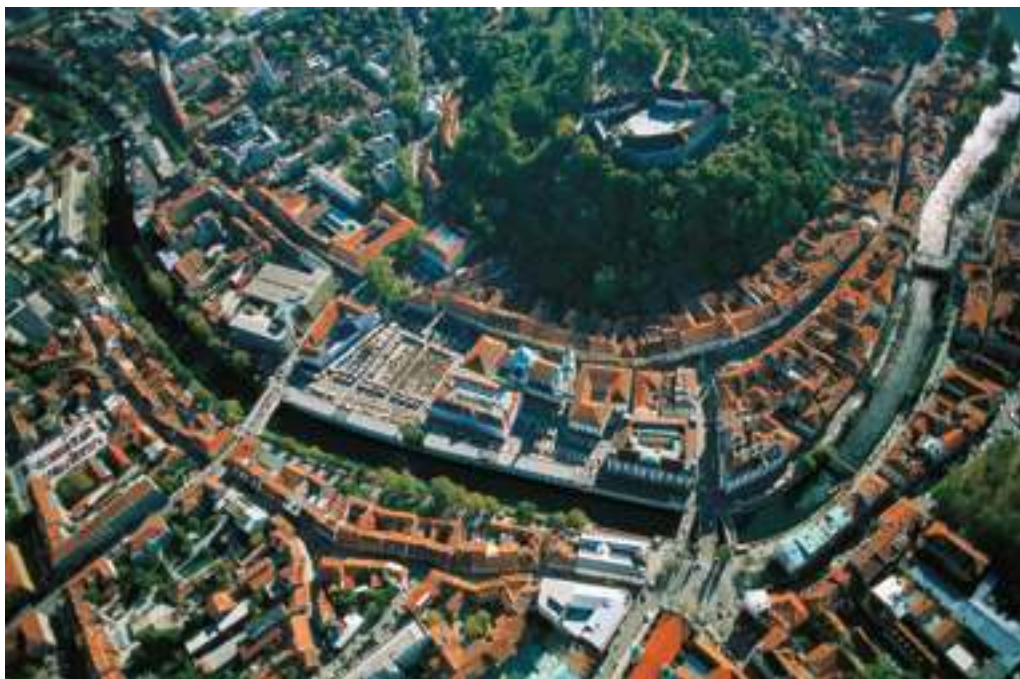
Aerial view of the old part of Ljubljana with the medieval castle.

Ljubljana's history goes back several thousand years. Archaeological findings from the Bronze Age are proof that as early as 2000 BC fishermen and hunters lived in pile-dwellings on the lake which once covered the Ljubljana basin. Prior to Roman colonisation, Roman legionaries erected fortresses alongside the River Ljubljanica which subsequently grew into the walled Roman settlement of Julia Emona. The city, with its castle originating in the 12th century and its old city centre, also boasts a rich medieval heritage, as well as numerous Renaissance, Baroque and Secessionist buildings. In the 20th century the works of the architect Jože Plečnik gave the city a new character. There are numerous museums, galleries, theatres and other cultural establishments in Ljubljana.