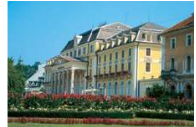
The Rogaška Slatina Health Spa, with its over 400 - years old tradition of healing with mineral water, is also famous for its glassworks producing crystal glass.

In Slovenia, there are currently fifteen health and tourist resorts, the best known being Čatež, Rogaška Slatina, Radenci and Podčetrtek. All of these resorts are certified natural health spas; but they also realised that providing water with healing properties and accommodation were simply not enough to please the customers of today. Therefore, besides modern swimming pools, hotel facilities and expert medical assistance, they also offer 'wellness' services for a healthier lifestyle. Traditional health resort services and established physiotherapy methods are thus complemented by different types of massage, beauty programmes, health diets, and weight-watching programmes.