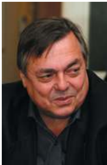
Drago Jančar, the most translated contemporary Slovenian writer and playwright.

The situation is more optimistic from the point of view of public libraries, which have been significantly modernised since independence. There are more than 60 public libraries, which successfully cover the whole country. The loan rate is high (Slovenia holds second place in the EU, after Denmark) and is approaching 20 million per year, which means an average Slovene borrows more than 10 items annually.