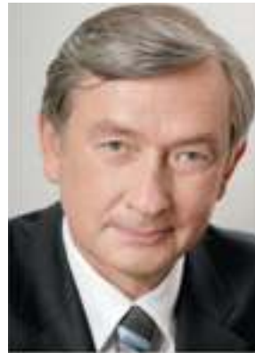
Dr Danilo Türk, President of the Republic of Slovenia, elected on 11 November 2007.

The President has no influence over the composition of the government, which is the task of the Prime Minister and the National Assembly. The President of the Republic may dissolve the National Assembly, if, after two successive proposals of a candidate (the second proposal may come from the National Assembly), it fails to appoint a Prime Minister. Should the National Assembly be unable to convene due to a state of emergency or war, the President may, on the proposal of the government, issue decrees, which have the force of law. The President of the Republic is elected for a five-year term in direct, general elections by secret ballot. The candidate receiving a majority of the valid votes cast is elected President of the Republic. If no candidate receives an outright, the top leading candidates compete in a runoff election. A President may serve a maximum of two consecutive terms. Since the office of Vice-President does not exist in the Slovenian political system, in the event of the prolonged absence of the President, the President of the National Assembly temporarily performs the duties of the President.