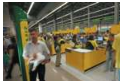
In the shopping centres of Mercator and Merkur.