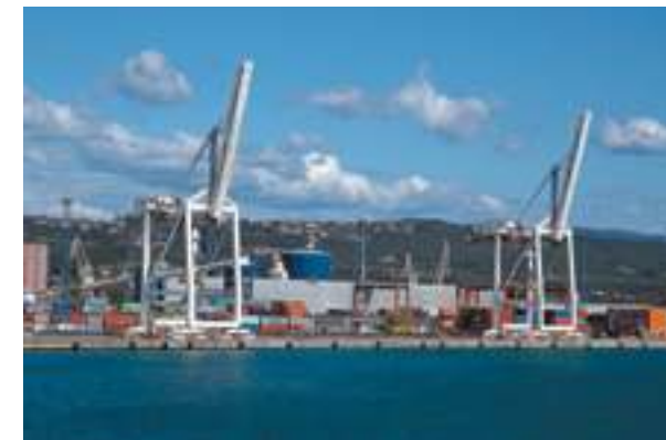
Koper is an important port for Austria, southern Germany and the Central European states.

In 2007, the state road network included almost 6,500 km of state roads, among which were more than 500 km of motorways. The construction of motorways continued in 2008 as total of 94 km of new sections were put into operation while 65 km of sections were under construction with the aim of completing the main motorway cross on the European Corridors V and X. Slovenia has rail links with all neighbouring countries. In the area of rail infrastructure, action is being undertaken to invest in the renovation and modernisation of the rail infrastructure on corridors V and X. The Port of Koper, which in the last few years has seen an increase of cargo and passenger traffic, has good links with Central and Eastern Europe. Slovenia has three international