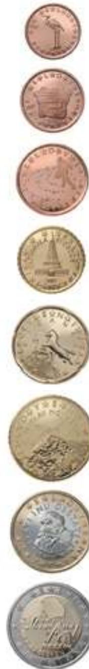
Slovenian euro coins.

The Bank of Slovenia is the central bank of the Republic of Slovenia. It was established in June 1991 within the package of legislation for independence. One of its first tasks was overseeing the transition to a new currency, the Slovenian