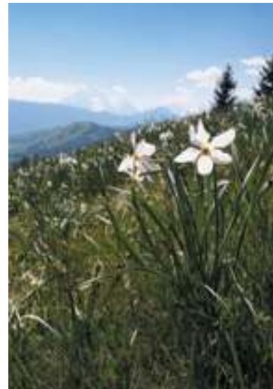
Narcissi on Mt Golica.

Representatives of Slovenian ministries and government offices are involved in the working bodies of the Council of Europe, dealing with various issues, such as human rights, the