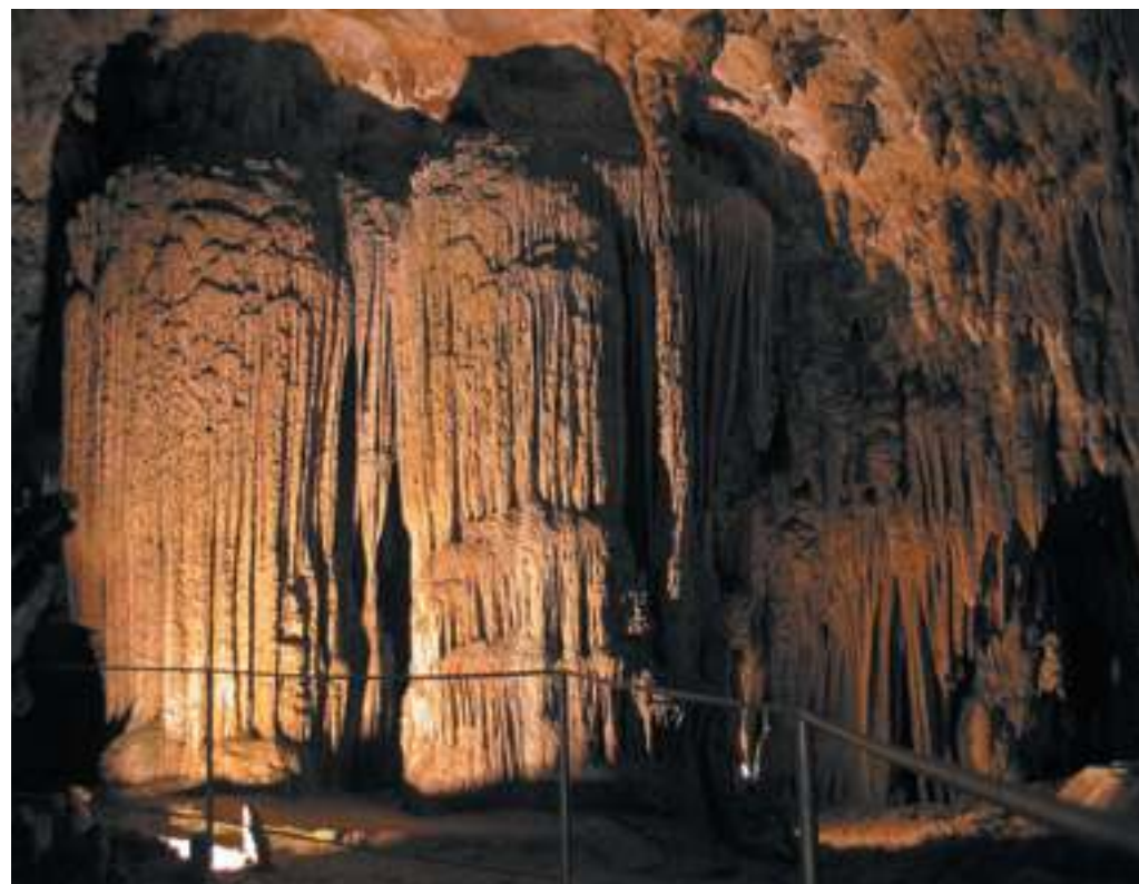
The Škocjan Caves, a UNESCO World Heritage site since 1986.

The term Slovenian Istria designates the northernmost and northwestern part of the Istrian Peninsula between the Kvarner Gulf and the Gulf of Trieste. It extends from the Adriatic Sea to the west towards Kraški rob and Bržanija to the east, and from the Italian border to the north towards the