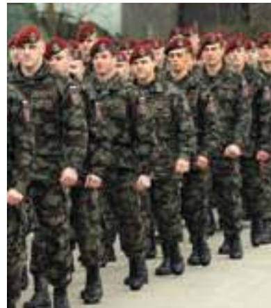
Soldiers of the Slovenian Armed Forces.

All the above mentioned was achieved through formal and informal work. In total, more than 8,000 events were held during the Slovenian EU Council Presidency: 283 events took place in Slovenia, 3,285 in Brussels and 4,242 elsewhere in the world. Besides the two European Council meetings, four other events at the highest level were organised under the Slovenian Presidency: summits between the EU and Japan, Latin American and Caribbean countries, the United States and the Russian Federation.