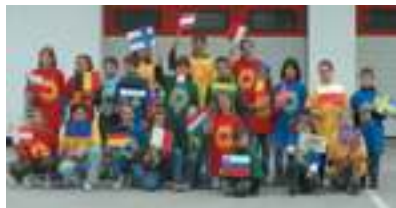
United in the European Union.

It is not surprising that after independence the new Slovenian Government recognised EU membership as one of the country's immediate priorities. The Europe Agreement, signed in 1996, came into force on 1 February 1999. Membership negotiations began in March 1998 and were concluded in December 2002.