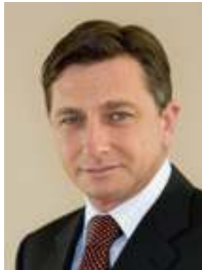
Borut Pahor, Prime Minister of the Republic of Slovenia since 21 November 2008.

The Prime Minister-elect is proposed to the National Assembly by the President of the Republic after discussions with representatives of the parliamentary deputy groups. If his proposal is not elected in the first ballot, the President can nominate the same candidate again or a new one, while the Prime Minister-elect can also be proposed by deputy groups or at least ten deputies. The Prime Minister-elect then puts forward nominations to the Government, and ministerial candidates are required to present themselves to the relevant Committees in the National Assembly, which then vote on their suitability. The National Assembly then approves the ministers with a simple majority.