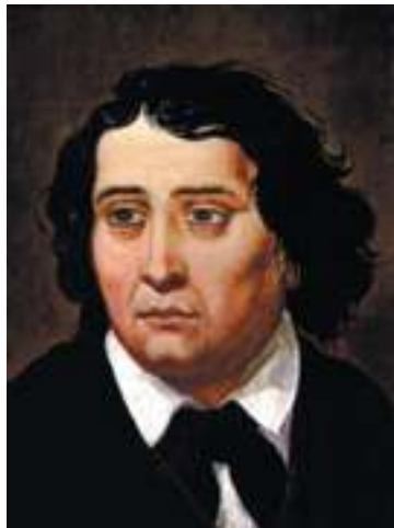
France Prešeren (1800-1849), the greatest Slovenian poet.

After the re-establishment of Catholicism, this culturally rich period was followed by almost two centuries of stagnation. Slovene appeared in written form only in few liturgical publications or manuals. A literary culture, which would include fiction, did not exist, nor did other forms of high secular culture. Only towards the end of the 18th century, when the successful wave of the Enlightenment reached Ljubljana, did the situation begin to change, when the first literary works emerged (and were translated). But a few decades had to pass before Slovene could live the artistic life of a fully developed literary language. The external conditions were provided by European Romanticism, which addressed the issue of national languages, while the internal conditions were met when France Prešeren, a poetic genius emerged from this language.