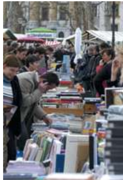
Buying books in the open air.