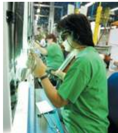
The realisation of women's rights, guaranteed by the Constitution, is monitored by the Government Office for Equal Opportunities.