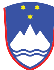
Slovenian coat of arms.