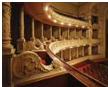
The Ljubljana Opera house.