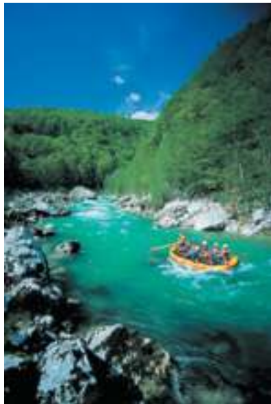
Rafting on the Soča river.

The land between the Gulf of Trieste, the Brkini Hills and the Vipava Valley is known as Kras. Experts also refer to it as the original Karst, as the word karst and karstic refer to many specific geological processes and phenomena. This word was adopted by many languages around the world and also gave its name to karstology, a science specialising in exploring different aspects of these phenomena. The Karst is also home to white Lipizzaner horses, named after the village of Lipica, where they were first bred in 1580 by crossbreeding the original Karst horse with Spanish, Neapolitan and Arab