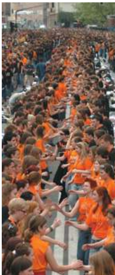
Secondary school graduates dancing a quadrille in the streets of Ljubljana.

taken at the end of a 4-year secondary school programme) or a vocational ' matura ' examination plus an additional exam for university first-cycle study programmes; a vocational ' matura ' or a general ' matura ' certificate for professional first cycle programmes; a first-cycle degree from corresponding field of studies (and additional exams in other cases) for masters' studies; a second-cycle degree for doctoral studies; the results of additional tests, if special abilities (e.g. artistic talents, physical skills) are required for certain study programmes.