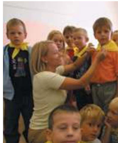
The first day at school.

Altogether, 98% of primary school leavers decide to continue their education immediately after primary education, and 84% of secondary school leavers go on to tertiary education. With regard to secondary education, more and more pupils are opting for four-year secondary school programmes. There are twice as many students in higher education as there were at the beginning of the nineties. Life-long learning is also increasing. Adults attend open universities, educational and study centres, schools and higher education establishments, as well as courses organised by companies, administrative bodies, organisations and societies. Adult programmes are organised within schools and outside them, education can be formal or informal, and there is also organised self-learning. A new act introducing a certification system was passed in 2000. It enables the assessment and verification of vocation-related knowledge, skills and experience acquired out of school. It thus makes it possible for individuals to obtain a vocational qualification in ways other than through formal