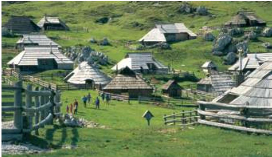
Velika Planina with its unique shepherds' huts architecture.

sectors of the Slovenian economy (in 2010 the contribution of Travel & Tourism to Gross Domestic Product (GDP) was 12,1% (Source: WTTC 2010)) in the next few years, thus significantly contributing to Slovenia's development goals.