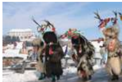
Kurenti , the typical carnival figures of the Ptujsko polje.

Hilly Haloze is a fertile wine-producing area where, among other varieties, the laški rizling and renski rizling grapes are grown, producing top-quality wines. In the middle of the Ptujsko polje Plain, on the banks of the River Drava stands the town of Ptuj, formerly a Roman military outpost and one of Slovenia's oldest towns. The most prominent feature of the town is its medieval castle. Ptuj is famous for its carnival festival known as Ptujsko kurentovanje . The event is named after the most recognisable carnival figure of the Ptujsko polje, Haloze and Slovenske gorice areas: the kurent or korant . The town boasts a remarkable wine cellar in the 13th century Friars Minor Monastery.