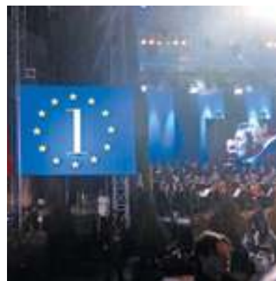
On 1 May 2004 Slovenia became a member of the European Union.