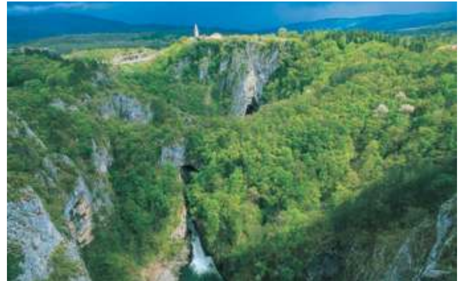
The Škocjan Caves Park.

In the area of the Sečovelje salt pans landscape park (864 ha), 45 endangered plant species can be found. The extensive marshland is an important nesting place for more than 80 bird species.