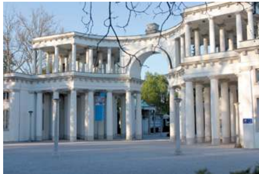
Entrance to Žale, Ljubljana's main cemetery, designed by architect Jože Plečnik. The complex consisting of a monumental gateway, an administration building and fourteen mortuaries is also on the list of European Heritage sites.