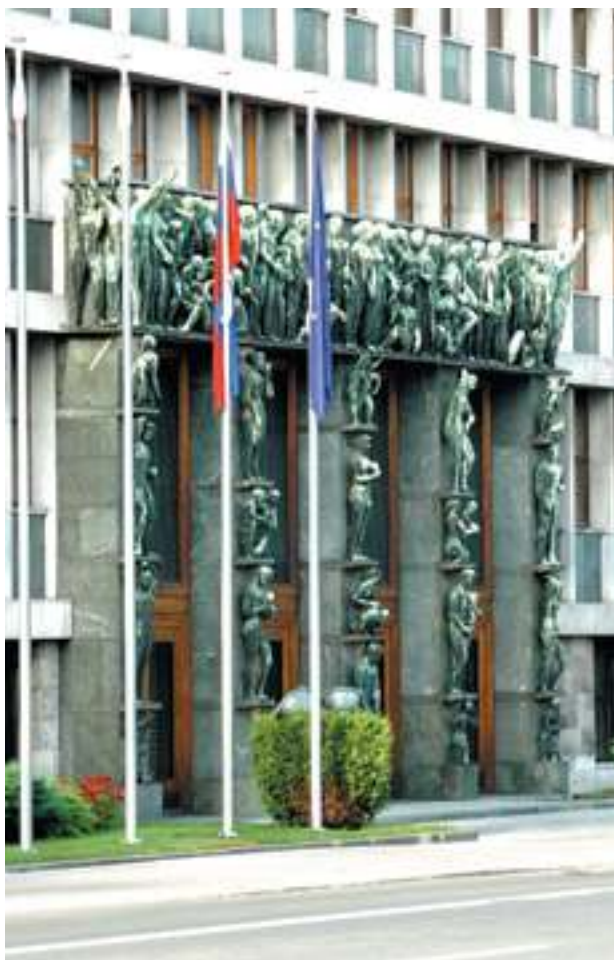
The parliament building on Šubičeva Street in Ljubljana houses the National Assembly and the National Council of the Republic of Slovenia.