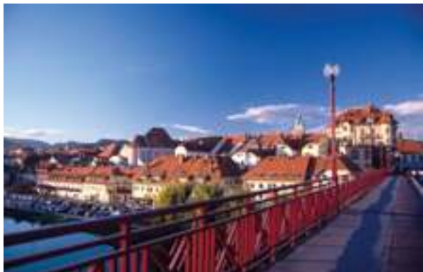
Maribor, the capital of the Štajerska region.

Our journey through the regions of Slovenia now takes us towards the northeast, across the River Sava and on to Štajerska. First, we reach the areas known as Posavje and Bizeljsko. Near the town of Brežice lies the renowned Terme Čatež thermal spa and health resort, where the warm springs were discovered in 1797. In the immediate vicinity of the resort stands the 16th century Mokrice Castle, which now offers luxury tourist services, including a golf course and riding grounds.