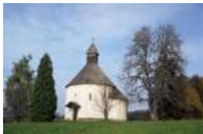
The 12th century Romanesque rotunda in Selo, Prekmurje.