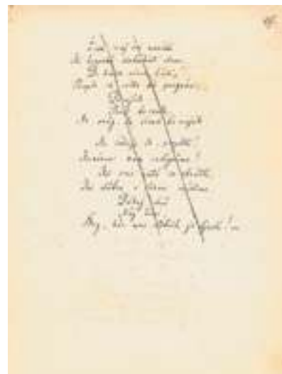
Prešeren's manuscript of Zdravljica from 1844.