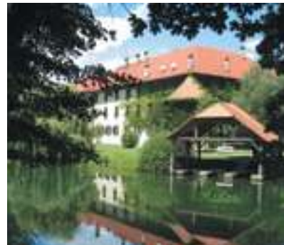
The Otočec castle.

The region known as Bela krajina is isolated from the rest of Slovenia by the Gorjanci hills and is imbued with southern Pannonian traditions. Its isolation explains why it is considered one of the country's most romantic regions. It is known for its wine-producing slopes, and also for belokranjske pisanice, traditional beautifully decorated Easter eggs.