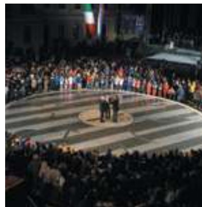
Celebrating the EU membership.

On 21 December 2008 Slovenia together with the Czech Republic, Estonia, Hungary, Latvia, Lithuania, Poland and Slovakia entered the Schengen area of free circulation – its border with Croatia thus becoming the external EU border. In the air traffic the border controls within the Schengen area were abolished on 30 March 2008.