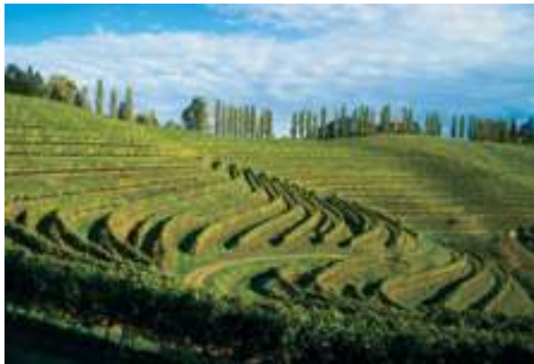
Vineyards from the Štajerska region.

Slovenia has three wine-producing regions: Primorska, Posavje, and Podravje. Each is divided into many wine-making districts, each having a selection of fine wines. Primorska produces several exceptional local wines. The most typical wine of the Slovenian Karst is kraški teran (Terrano Carsico), a red wine made from Refosco grapes. Its varietal, produced in the Koper district, is called refošk . The sun-bathed slopes of Koper district are also famous for malvazija (Malvasia) and other wines. The Vipava Valley is home to exquisite wines, such as zelen , pinela , grganja and klarnica , while Goriška Brda is most known for its rebula. The champion of Dolenjska in the Posavje wine-producing region is the ruby cviček , while Bela Krajina boasts metliška črnina and modra frankinja