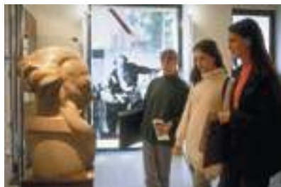
Visiting an exhibition.

The famous architect Jože Plečnik (1872–1957) left a special mark on the capital. Previously working in Vienna (the Zacherl House, the Church of the Holy Spirit) and Prague (Hradčany Castle), Plečnik knew how to combine Classicism with Modernism. In Ljubljana he designed the National and University Library, the Three Bridges, the Žale Cemetery, the building of the Vzajemna insurance company, and other buildings, which gave the city a touch of classical and modernistic architecture.