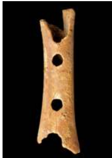
A Neanderthal flute, at least 45,000 years old, found at the Divje babe archaeological site in 1995, is probably the oldest musical instrument in the world. The flute is kept by the National Museum of Ljubljana.

In the 4th and 3rd centuries BC, the territory of the present-day Slovenia was occupied by Celtic tribes, which formed the