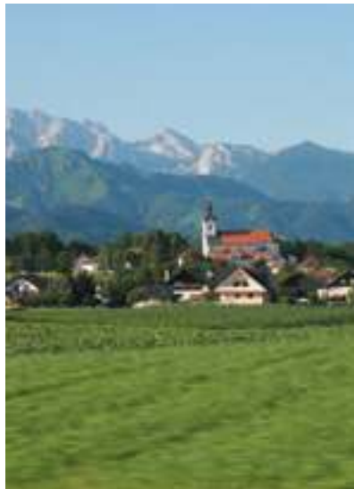
The picturesque village of Komenda in the Gorenjska region.

The right to health care services comprises services at the primary health care level, including dentistry, health care services in certain types of social care institutions, specialist outpatient services, hospital and tertiary level services. It also includes the right to health resort treatment, rehabilitation treatment, transport by ambulance and other vehicles, medicine, and technical aids.