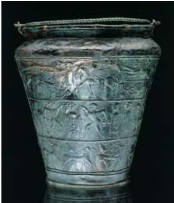
Vaška Situla, an ornamented bronze vessel from the first half of the 5th century BC, found in Vače near Ljubljana. The Situla is kept by the National Museum of Ljubljana.