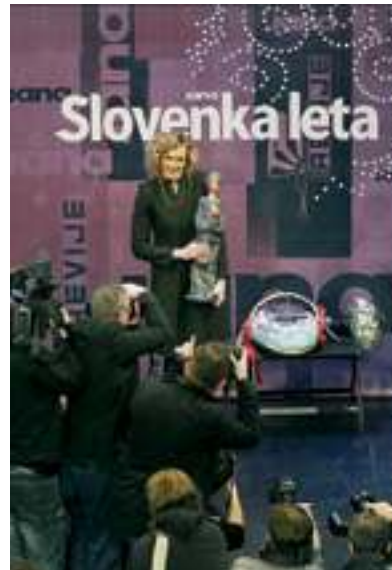
Petra Majdič, Slovenian woman of the year 2010.