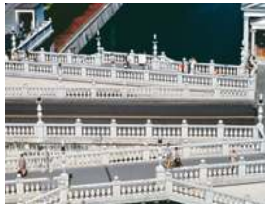
The Triple Bridge, designed by the architect Jože Plečnik.