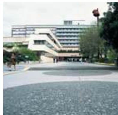
University Medical Centre in Ljubljana

In 2004, a new kind of employment subsidy for long-term social assistance beneficiaries was introduced. Its aim is to encourage the employment of people who depend on social assistance and to increase their income. The state also particularly promotes the training and employment of the disabled, and the care for people with mental or physical disabilities.