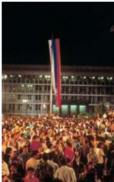
On 25 June 1991 the people of Slovenia celebrated the declaration of an independent state, following an 88.2 % plebiscite vote in 1990.

With a similar coalition the LDS was able to govern for twelve years, with only one interruption in the second half of 2000. It managed to establish a liberal political culture by passing numerous fundamental laws, for example with regard to education, and to carry out a social and economic transition into a social market economy with private initiative. In comparison with other post-communist countries it managed to prevent excessive social differentiation. The economic sector, even though still largely owned by the state, successfully adapted to the world market and recorded significant growth. In 2004 Slovenia joined the EU, with considerable popular support, and NATO. At the parliamentary elections in the autumn of 2004 the Slovenian Democratic Party won and formed a centre-right government, headed by the leader of the Slovenian Democratic Party Janez Janša. The Government continued a successful economic policy with 5 per cent economic growth and reforms of the tax and salary systems. It succeeded in meeting the Maastricht criteria and Slovenia joined the Eurozone (the first transition country to do so) on 1 January 2007. Slovenia is also the first new Member State to assume the Presidency of the Council in the first half of 2008. At the elections in 2008 the Social Democrats won the elections and formed a centre-left government, headed by the leader of the Social Democrats Borut Pahor.