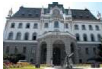
The University of Ljubljana has, since its beginnings in 1919, had its main seat at the former provincial mansion, built in 1902.

Higher education institutions are universities, faculties, art academies and professional colleges. Public faculties, professional colleges and art academies can only be founded as members of public universities. Private (single) higher