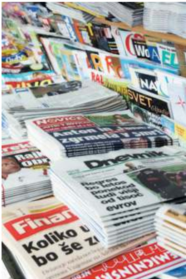
In Slovenia eight newspapers are published daily.