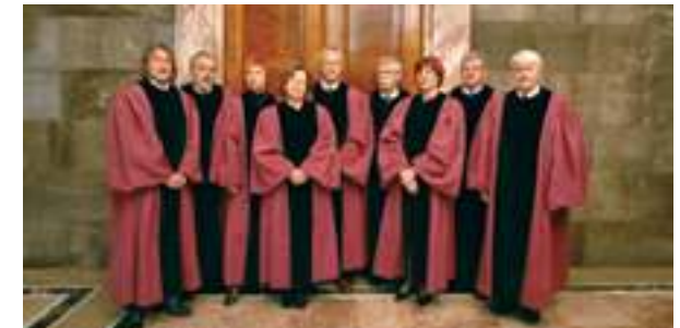
The judges of the Constitutional Court.

The Constitutional Court is the highest body of judicial authority with regard to the protection of constitutionality, legality, human rights and basic freedoms. It may act as a negative legislature and abrogate an act or part of an act. Constitutional Judges are appointed by the National Assembly following the proposal of the President of the Republic. Nine judges are elected for a period of nine years, with no possibility of a further term. The office of a constitutional judge and judges of specialised and general courts is incompatible with other offices in state bodies.